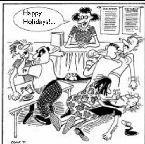
The Holidays can sure bring out the best in us.